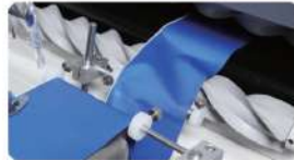
Continuously controlling the temperatures to press and fold the edges