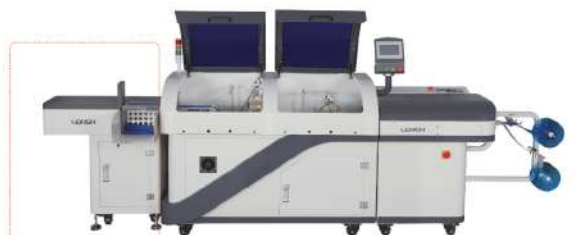
All receiving part options

It can intelligently complete at once and automatically receive and stack up the cloth. Can improve the production efficiency, easy operation and less manpower. Achieving the unmanned operation, one person can operate several machines.