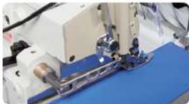
Placket cloth be hemmed the edges automatically