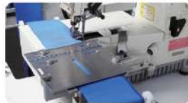
Placket cloth be sewed the one-centimeter line automatically