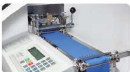
Placket cloth be cut off automatically