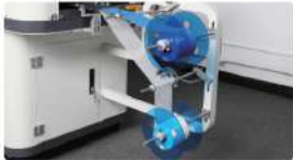
Interfacings and underlining can overlap and feed automatically

Having the characteristics: interfacings and underlining can overlap and feed automatically, continuously controlling the temperatures to press and fold the edges, use the one-centimeter line, cut off, receive and stack up, all complete at once automatically.