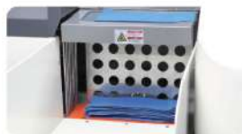
Placket cloth be received and stacked up